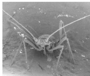
Flonicamid (50 ppm), 3 days after application